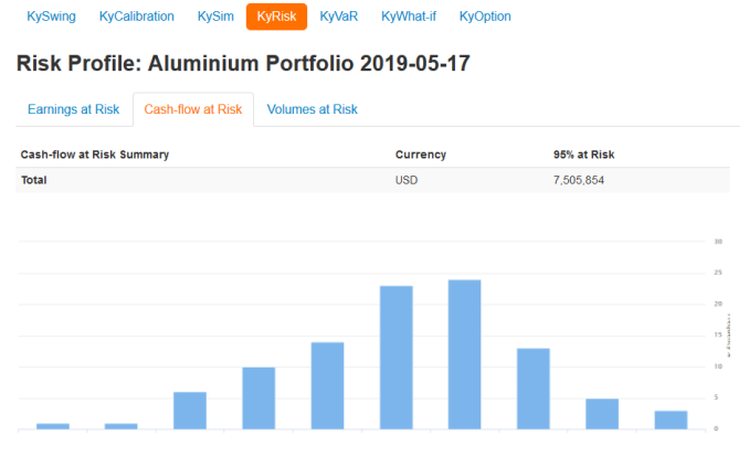
Figure 2 Distribution of cashflows